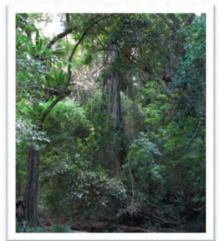
Photo 1. A typical example of a patch of rainforest growing in a gully with a dense canopy and understory features including strangling figs, plank buttresses, large epiphytes and woody vines.

This introductory guide provides basic information on sub-tropical rainforest and outlines the steps required to restore it through revegetation.