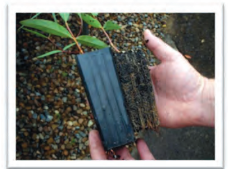
Photo 9. Where practical, seedlings should be grown in fluted pots to avoid roots spiralling around the sides which can later cause root strangulation, poor tree growth and even premature death.

Native plant or forestry tubes are commonly used for native plant propagation. The standard tube is 50 mm square x 120 mm high. Use fluted tubes rather than smooth ones to ensure that roots are directed downwards (Photo 9). Seedlings grown in these sorts of smaller tubes are easy to store, transport and are less expensive. Most nurseries take back the pots to be cleaned and reused, so don't leave them at your planting site!