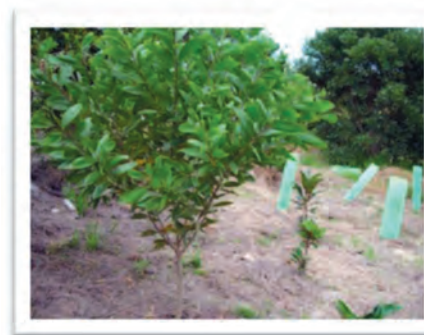
Photo 7. Early successional species such as this Acacia should be considered for cleared sites to quickly help 'capture' the site and may not need the added expense of tree guards.