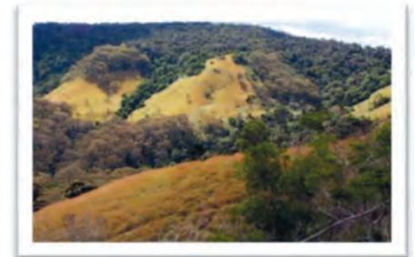
Photo 2. Patches of rainforest (dark green) are often found growing in gullies surrounded by drier eucalypt forests (grey-green) and grassy pastures.