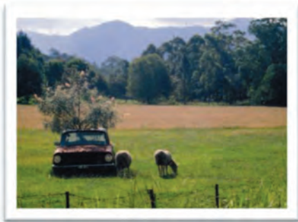
Photo 13. Monitoring starts with a keen pair of eyes and an enquiring mind. This Grevillia growing out of a junked car shows us the importance of controlling grazing and the ability of some rainforest species to naturally regenerate if given a chance.

in terms of structure (layers of vegetation) and wildlife habitat. This usually requires baseline data to be collected prior to planting to use as a comparison. For example the rainforest structure provided by the planting and its ability to provide habitat to fauna should be tracked over time. An increase in fauna numbers post planting compared to pre planting will show that the revegetation has been successful in providing wildlife habitat;