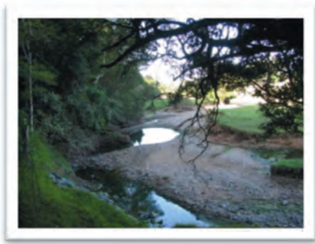
Photo 4. Erosion along this stream bank will need to be controlled to ensure successful rainforest restoration. Fast growing pioneer species may be best for such eroded conditions.