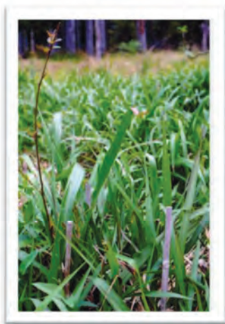
Photo 10. Weed control is key to seedling survival. This one is being smothered by paspalum which is strongly competing for sunlight, soil moisture and nutrients. This seedling is also suffering from being browsed.

Good weed control is essential for the success of any restoration planting. Many weeds, particularly vigorously growing grasses such as kikuyu or paspalum found on cleared agricultural land, compete with newly established seedlings for moisture (Photo 10). They can also shade-out young seedlings. Therefore, weeds should be controlled within an area at least 0.5-1 m diameter around each seedling site. This weed control should continue for at least two years after planting to ensure the plants are vigorous enough to out-compete the weeds. In a densely planted rainforest situation a good shady canopy should have established by this stage.