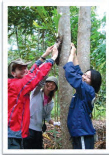
Photo 12. Consider supplementary hand planting including epiphytes.

a good way to keep community volunteers involved in your site.