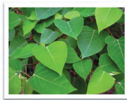
Photo 6. These seedlings of Homalanthus grow quickly to outcompete weeds and provide shade for a later succession of plants that are often spread by birds roosting in this pioneering shrubby tree.

Caution, pioneer species generally have sparse canopies and the higher light conditions can allow weeds to flourish. Therefore, more maintenance is usually required to control weeds until later successional plantings create a dense canopy and deep shade. This option, is usually cheaper in the short-term, but requires longer-term maintenance to ensure the site remains on a trajectory towards a diverse rainforest community.