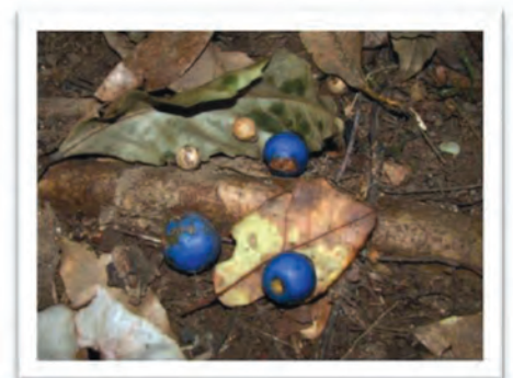
Photo 3. Fruits of the blue quandong ( Elaeocarpus grandis ) that are dispersed by wildlife including some rainforest pigeons. These seeds will only be naturally dispersed into your site if a rainforest remnant is nearby and there are roosting trees on your site.