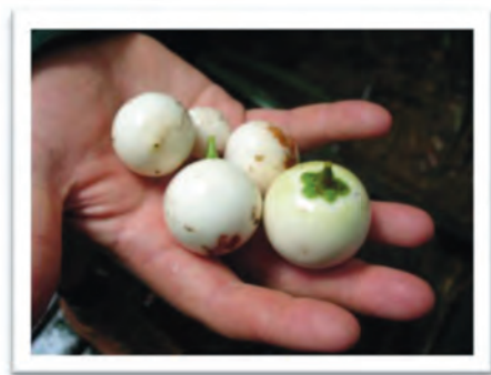
Photo 8. Many rainforest species used in restoration are sourced from fleshy fruits and are typically unsuitable for long-term storage as seeds. Therefore, planning needs to consider timing of collection, processing, planting, and species lists need to factor unavailability of some species in some years.

Securing a supply of seed should be considered at least a year in advance of planting. Seed of the required species may only be able to be harvested for a short period in its natural habitat (Photo 8). Sometimes more than one seed collection season is required to acquire enough seed. Therefore at least one to two years advanced notice is needed for seed collection since many local provenance seed is not routinely stocked by seed suppliers (Text Box 2).