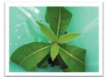
Photo 11. Tree guards reduce the impact of browsing animals, lessen weed competition and provide shade and shelter. However they add considerably to costs. Consider alternatives like fast growing acacias to provide similar ecosystem services.

the cost of revegetation due to the materials and the extra labour required.