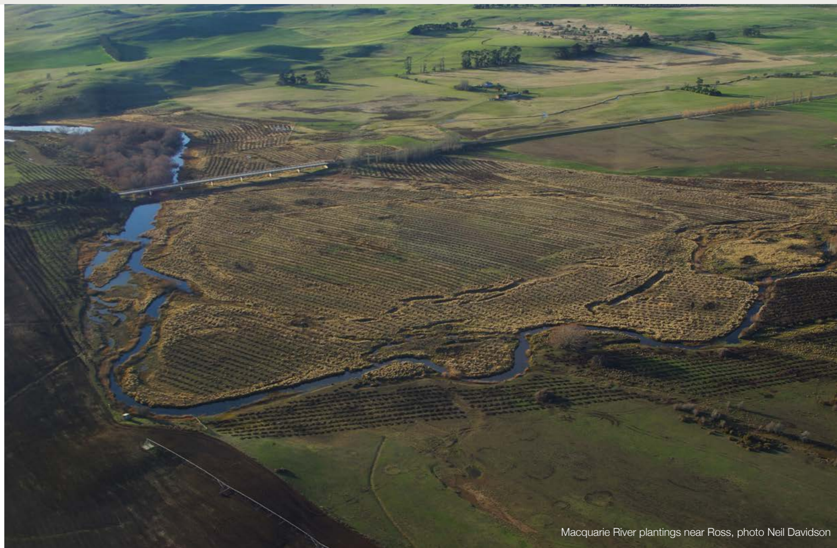
Macquarie River plantings near Ross

We are developing long term partnerships with landholders to ensure our work complements profitable agricultural enterprises. We are also reengaging the Tasmanian Aboriginal community in the midlands, who managed this land sustainably for over 40,000 years. We conduct educational programs with local schools and communities and, along with partners, are creating artworks in the landscape as a vehicle for inspiration, awareness building and community engagement.