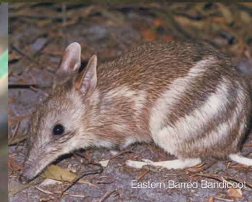
Eastern Barred Bandicoot