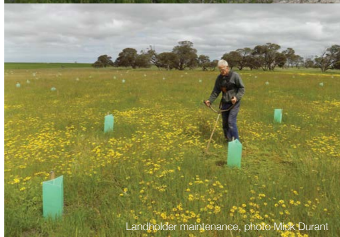
Landholder maintenance, photo Mick Durant