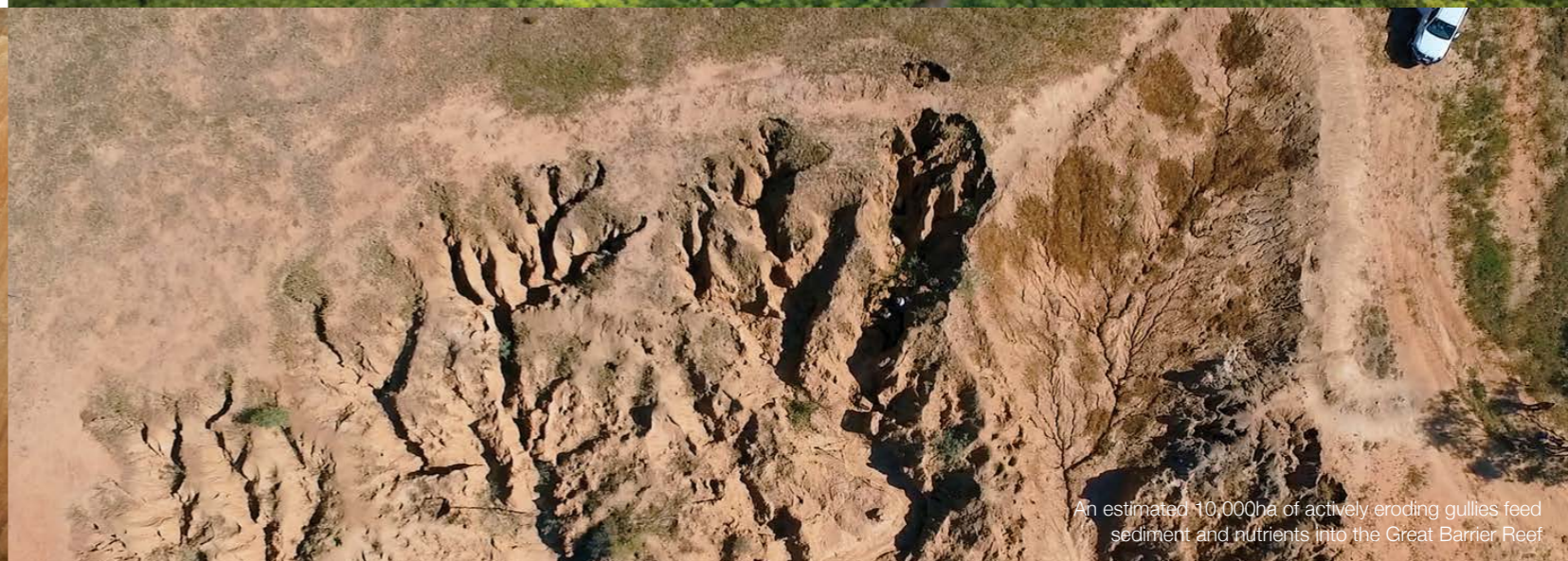
An estimated 10,000ha of actively eroding gullies feed sediment and nutrients into the Great Barrier Reef