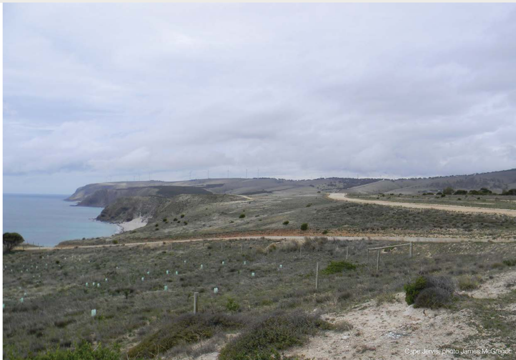
Cape Jervis

The 20 Million Trees Programme is part of the National Landcare Programme funded by the Australian Government.