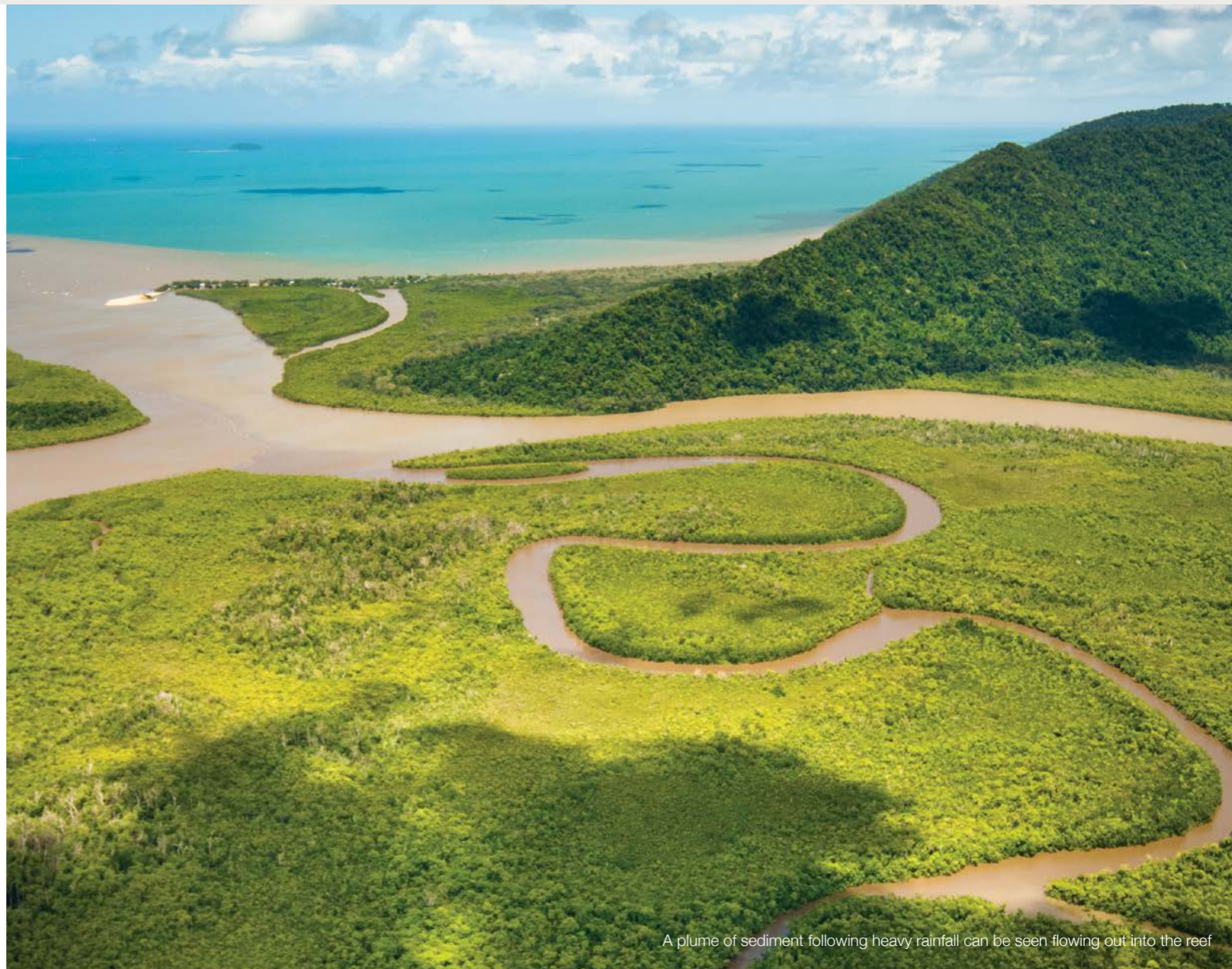
A plume of sediment following heavy rainfall can be seen flowing out into the reef

Over the next 3 years we will raise $20 million for the first stage of the estimated $100 million project. The program received a major boost last year when the Australian Government announced that they would match private contributions dollar for dollar up to $2 million.