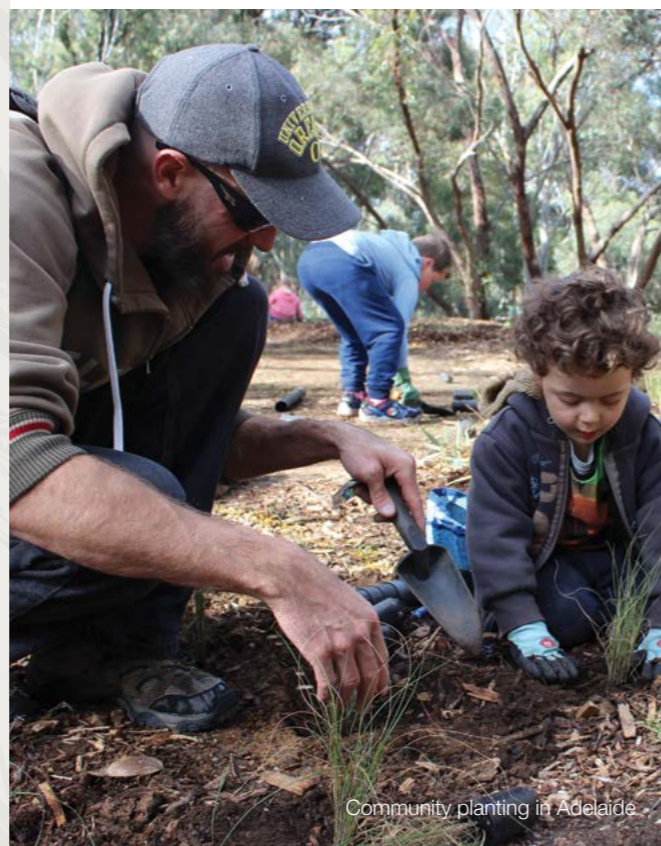
Community planting in Adelaide

To date, over 100 community volunteers have helped plant trees and shrubs in an important urban biodiversity corridor along the River Torrens. In the future, strategic actions from the program will help to guide investment in environmental projects to improve the quality of life for Adelaide residents.