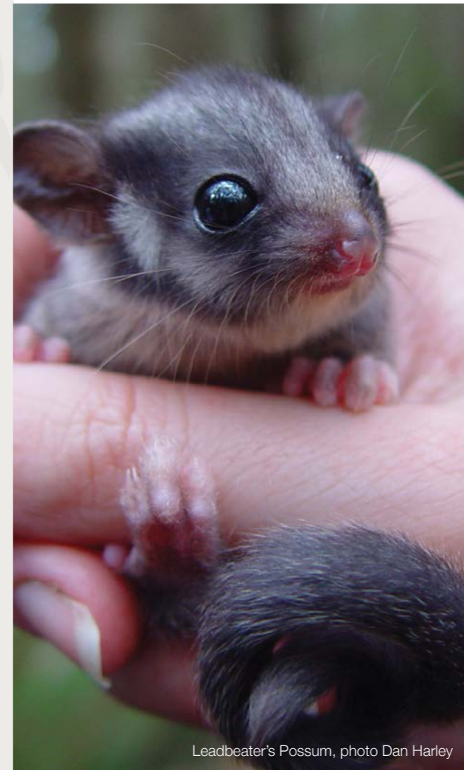
Leadbeater's Possum