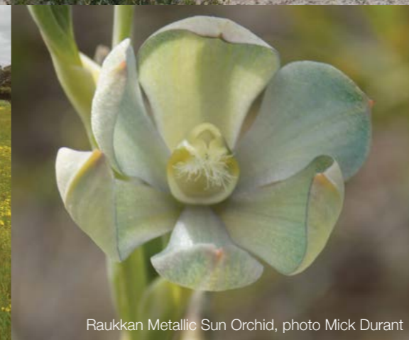
Raukkan Metallic Sun Orchid