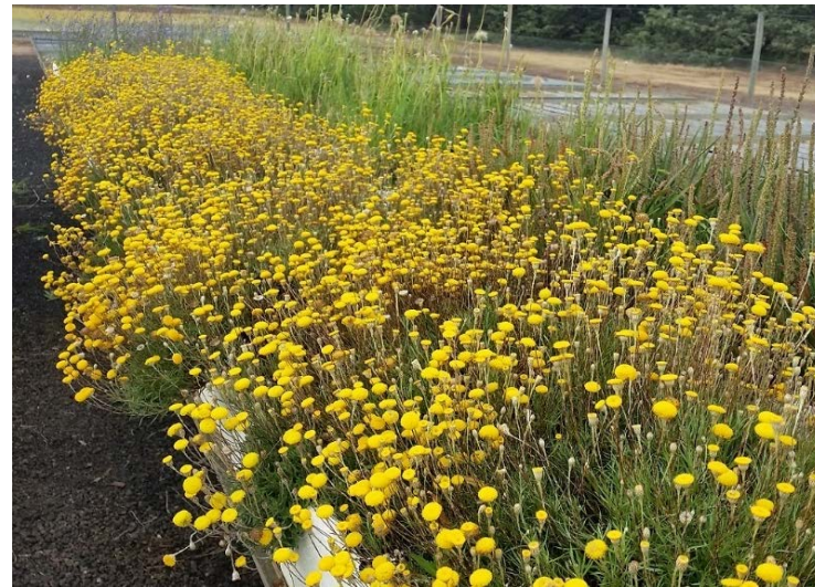
Image 3. The Woorndoo Project above-ground seed production area, November 2018.

In autumn 2018, Moyne Shire Council generously installed a light steel fence to define the restored grassland area and to separate it from the adjoining cropping (Image 5).