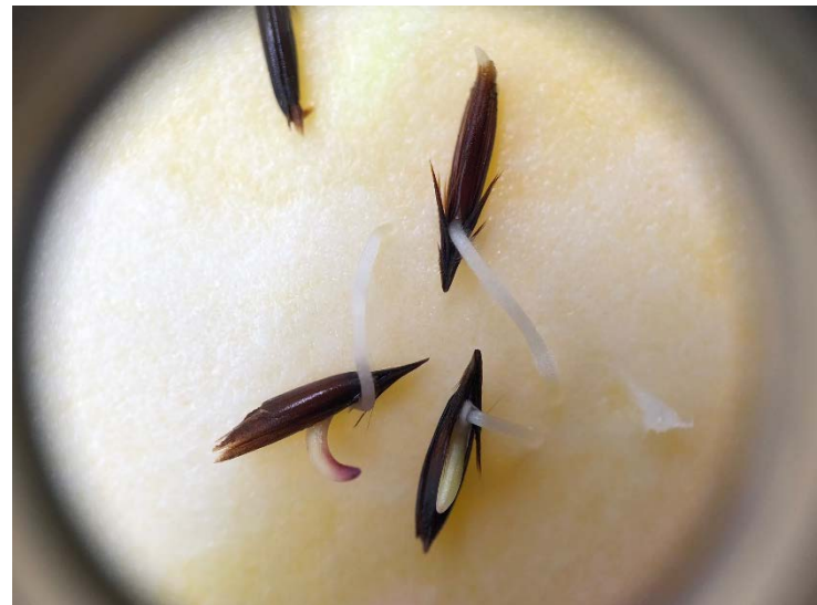
Image 2. Germinating Kangaroo Grass - Themeda triandra

Our cabinets have given us increased confidence in our capacity to characterise the quality of our seed batches. They also give us a unique opportunity to watch the germination process in action across a wide range of species (up close and personal with nearly 150 species!) (Images 1 and 2). We have also used the cabinets to help us work out what might be the most suitable conditions for some of our 'harder to germinate species' to good effect. Very recently we even used them to try and improve propagation outcomes for the threatened Spike Rice Flower - Pimelea spicata because we have had poor outcomes using our nursery set-up.