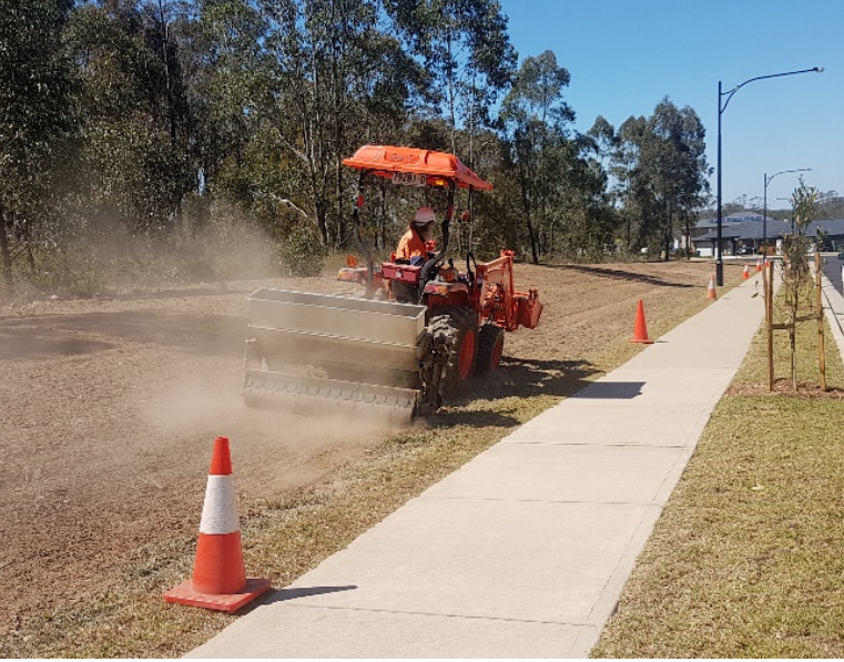
Seeding wildflowers close to pedestrian pathways in Jordan Springs