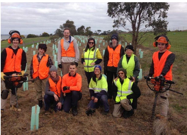
Image: The Gordon Tafe students assisting with numerous planting days to plant a section with 5000 trees and shrubs.

Funded through the National 20 Million Trees program and partnering with the City of Greater Geelong, Limeburner's Lagoon is undergoing some major revegetation and grassland sowing works over the next few years. This year the site has been planted with 5000 woodland trees and a section burnt and prepared for a scrape and autumn sowing in 2019.