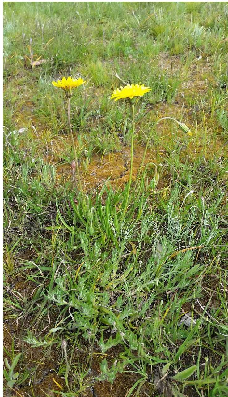
Image 4. Murnong – Yam Daisy - Microseris walteri.