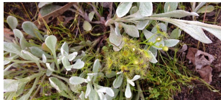
Image: Sundew germinating amongst the Common Everlasting in the scrape site, this species was not included in the seed mix.

The scrape area has also shown great germination with Common Everlastings - Chrysocephalum apiculatum , beauty-heads - Calocephalus spp. and a handful of Pussy Tails - Ptilotus spathulifolius . Yam Daisies - Microseris lanceolata were also planted as tubestock at the site from seed collected and grown at the Geelong Botanic Gardens Seed Production Area, as was Common Tussock-grass - Poa labillardieri (positioned around a remnant Red Gum).