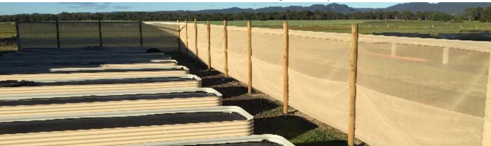
Image 2. The newly established raised container beds.