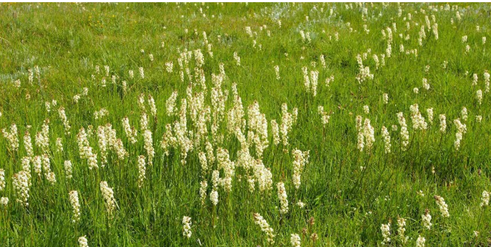
Image 2. Grassland Candles - Stackhousia subterranea flowering in early spring on the Woorndoo-Streatham Rd., south-western Victoria.