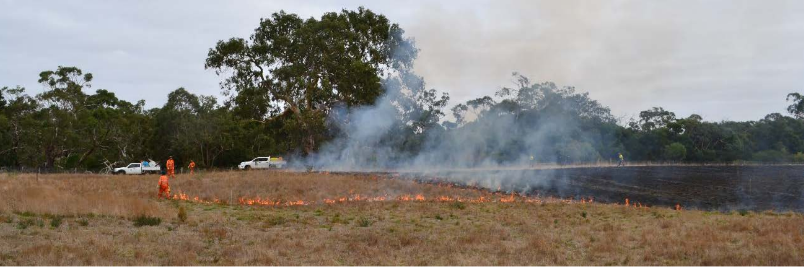
Ecological Burn underway at Inverleigh Grassland site.