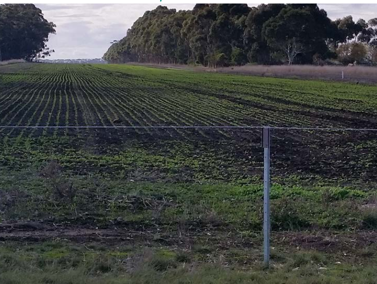
Image 5 (below). Steel fence installed by Moyne Shire Council in March 2018 to define the Woorndoo restored grassland and to separate it from the adjoining cropping operations. A further 1.25 ha of the cropped area will be direct-sown to a native grassland community in 2019.