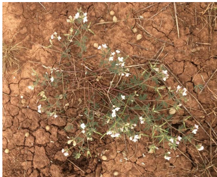
Austral Trefoil - Lotus australis at the Mount Cottrell restoration site now managed by Parks Victoria.

In the last edition of the Grassy Gazette I talked about the appearance of Austral Trefoil - Lotus australis var. australis , in our restoration site at Mount Cottrell, west of Melbourne. At last count there had been close to 12 individuals identified at the site. This species was not in the original seeding mix and further to this, the site had been cropped for close to 50 years prior to the restoration taking place (where site preparation involved the removal of approximately 100mm of topsoil). This species is considered rare in the Melbourne region and only occurs in Plains Grassland EVC's.