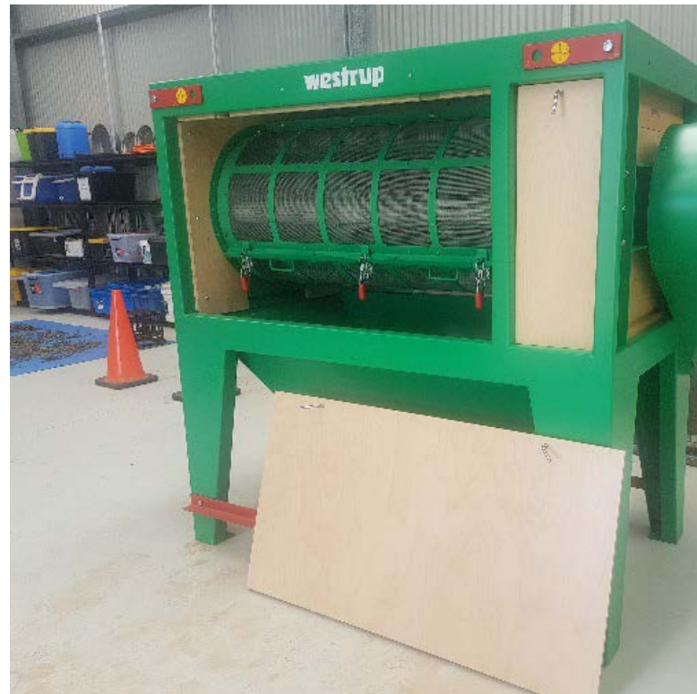
Image 1. The newly arrived 'Thresher' machine.