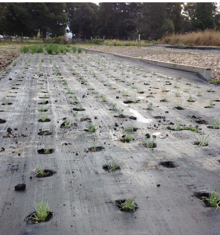
Nationally threatened Hoary Sunray - Leucochrysum albicans var. tricolor planted into the SPA beds.

The aim at the seed production area this year was to 're-fresh' after a plentiful harvest of Yam Daisy - Microseris lanceolata , Pale Everlasting - Helichrysum rutidolepis , Pussy Tails - Ptilotus spathulatus and Blue Devil - Eryngium spp. The primary focus this season was to extend beds holding the Nationally threatened Hoary Sunray - Leucochrysum albicans var. tricolor and Button Wrinklewort - Rutidosia leptorrhynchoides and to add some Chocolate Lily - Arthropodium spp. to the mix to establish a more diverse seed supply for future sowings.