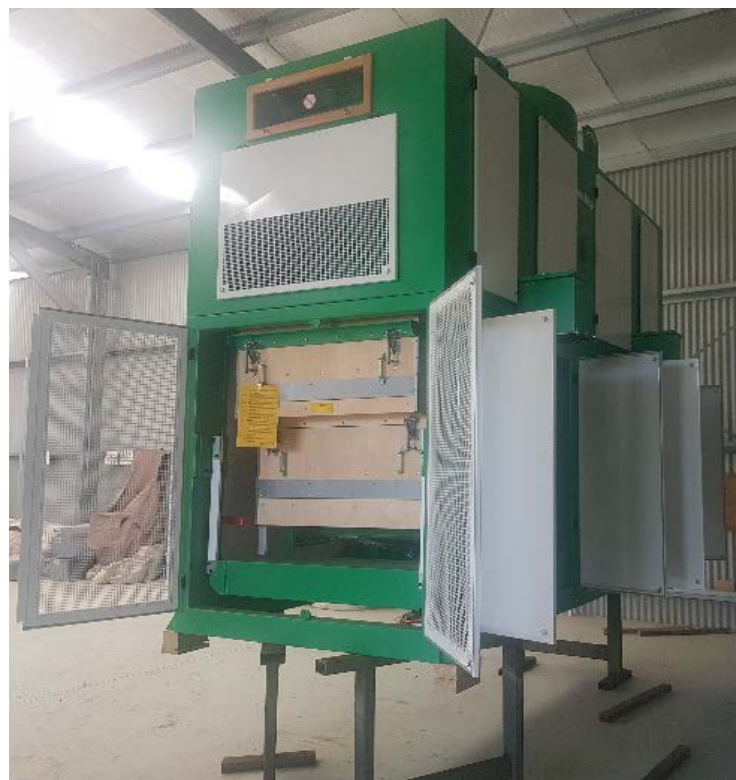
Image 2. Sieve / Aspiration separator.

It is very early days for this new adventure. The machines have only recently arrived and setting them up for operation will take extra time and effort. However, we remain hopeful, confident and a bit nervous (to be honest) that when in action they'll allow us to clean our seed to desired states more effectively and quickly than ever before. Of course, there will always issues to be considered with such technological advances. For example, grading small from large seed of a given species is a form of selection bias, and it may be that smaller seed could be associated with slightly different genetic traits than those in larger seed (an area for more research as they say in the classics). However, such considerations/conundrums are things our sector must have the courage to address as we strive to improve the way native seed is processed, handled and used.