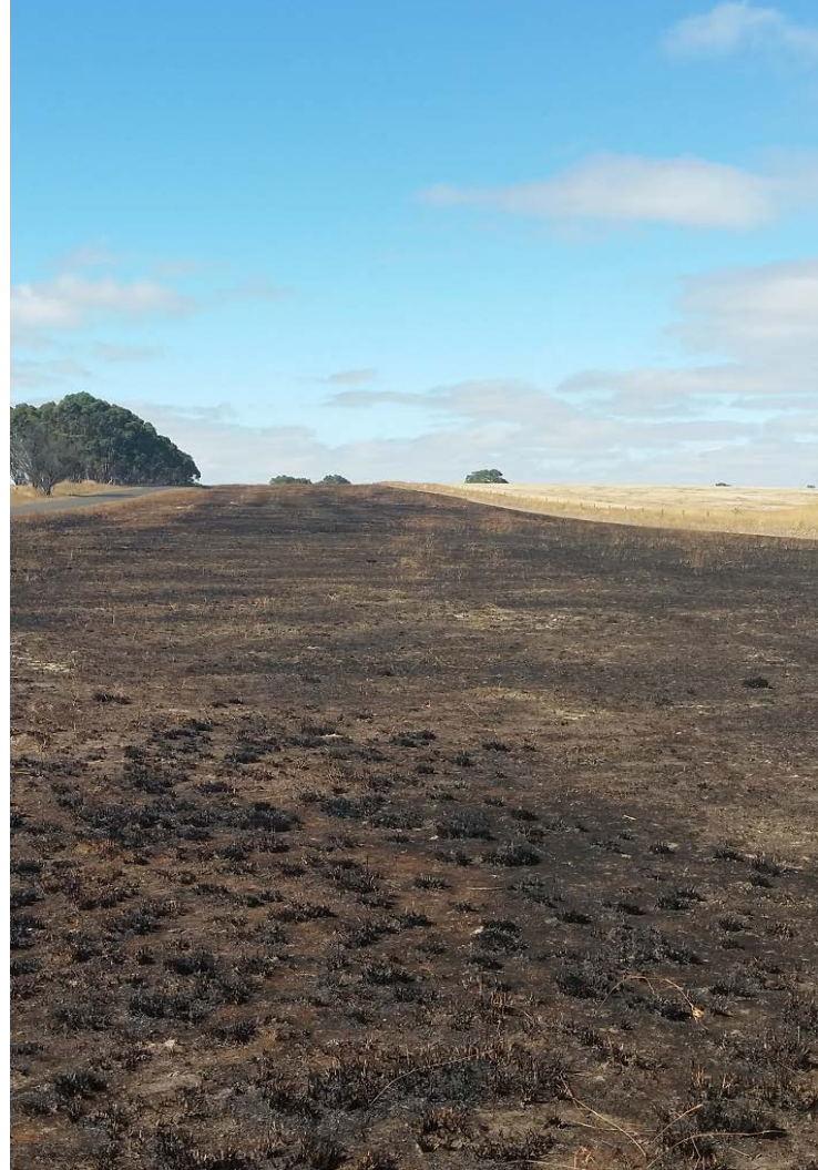
Image 1. A burnt Kangaroo Grass roadside community in the Woorndoo-Chatsworth district, summer 2018.

The returning spring vegetation across long sections of the road was magnificent. Presumably this is the result of many decades of regular burning. However, members of the team responsible for the exotic grass spraying were also ecstatic at the absence of both Phalaris and Cocksfoot in areas where it had been sprayed and subsequently burnt.