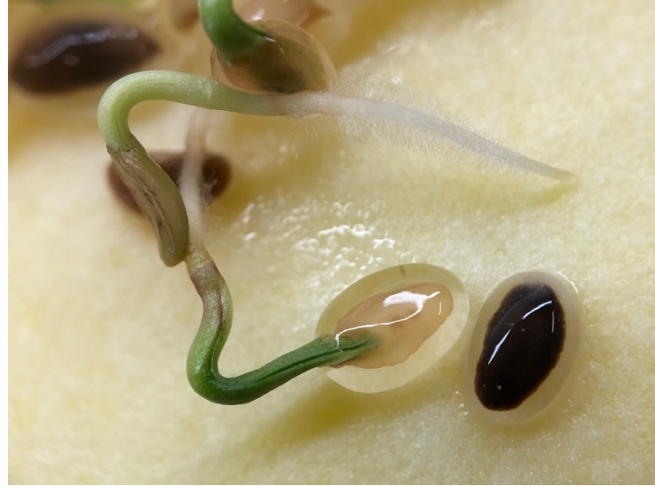
Image 1. Mucus formed on Plantago gaudichaudii seed when exposed to moisture

This is all in stark contrast to our capacity in past years where we conducted simple germination testing of seed batches in our nursery polytunnels. While these methods still gave us important basic understandings of batch quality (i.e. germinability under nursery conditions) the process had limitations due to a lack of control over various conditions. Whereas in our new cabinets, we can test known seed numbers or mass in petri dishes under specific sets of temperatures (and lighting). We have also compared nursery and cabinet testing and routinely found much higher germination outcomes in cabinets for the same species.