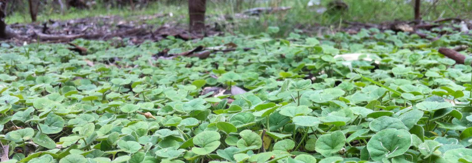
Carpet of Kidney-weed (Dichondra repens)