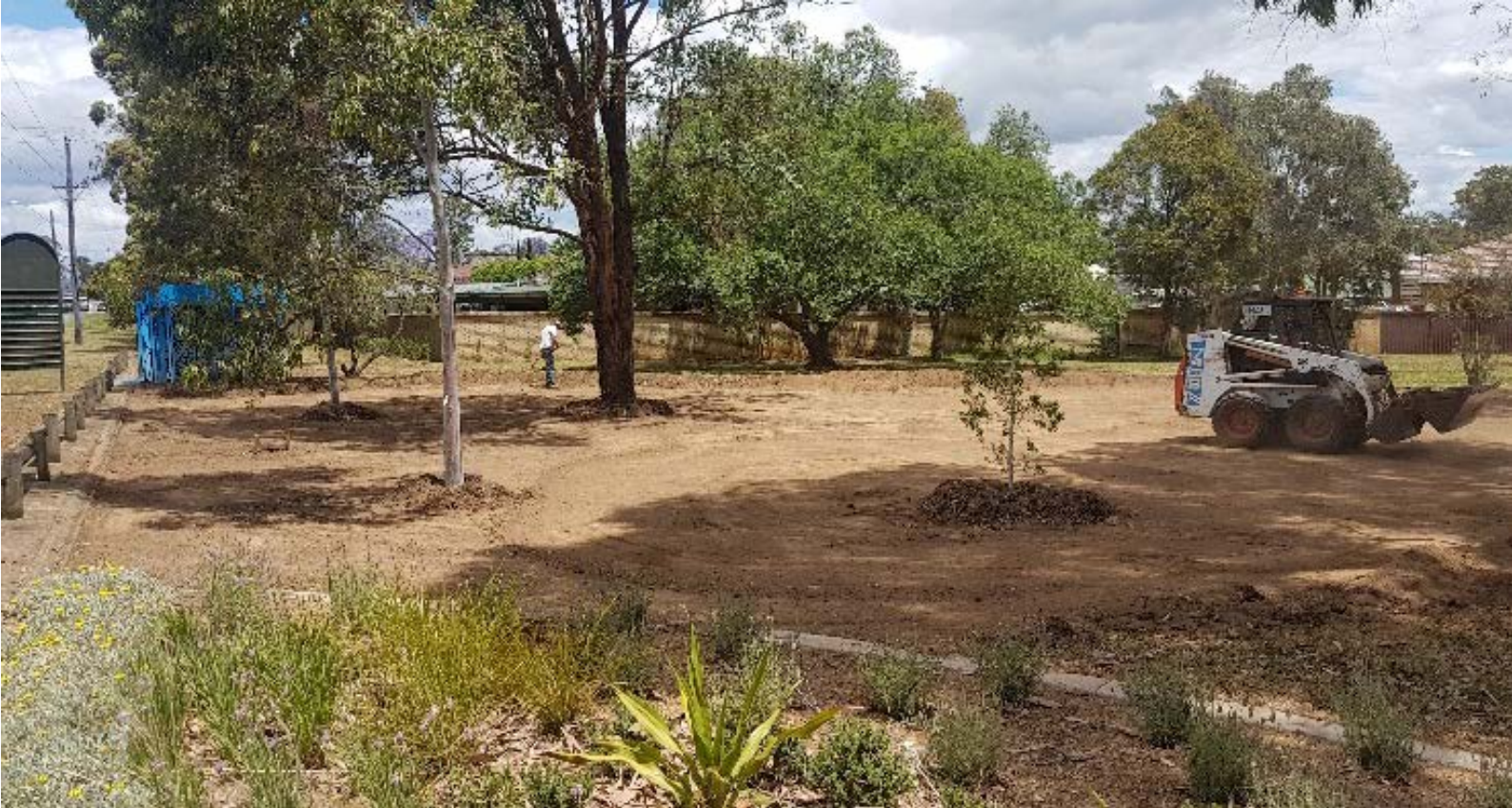
Preparing a small urban reserve for the installation of a glorious wildflower meadow

It is still very early days for these sites, but I am confident that in the next twelve months they will develop into some of our most important and persuasive showcases for how native wildflowers and grass can and should be embedded within our urban landscapes.