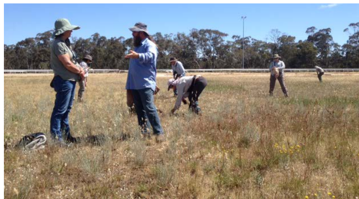
Image 2. The group enjoying a day out amongst the grasslands.

The Jallukar Landcare area is in the northern Grampians shire surrounding the townships of Stawell, Pomonal and Moyston. Our project thanks the Wimmera Catchment Management Authority and the Victorian Landcare Program for their ongoing support. And not forgetting that the WCMA was one of the original co-funders of the Grassy Groundcover Restoration Project over 14 years ago with 5 of PGR's trial sites still existing to this day in the Wimmera. These are a great resource for our current project as collection sites (and 14 years later is still my favourite project!).