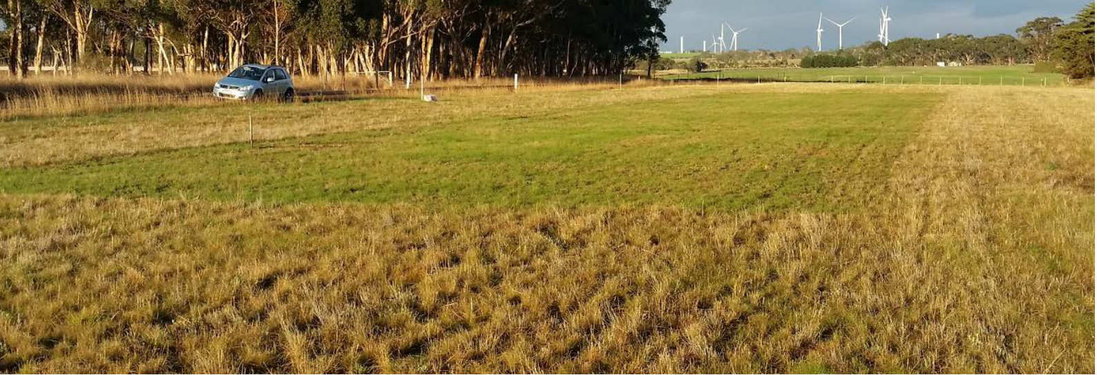
Image 4. The restored Woorndoo grassland, slashed and raked in preparation for the experimental plantings and sowings in 2018 and 2019.

During 2018, the Group were awarded a GHCA Landcare Grant. These funds will allow for detailed vegetation surveys of the Woorndoo-Chatsworth Rd and the expansion of the Group's seed production capacity. It is planned that these two activities will set the groundwork for the Group's next major activity – repairing, where necessary, and reconnecting the very high-quality remnants that occur along this three-chain road and other, similar roads in the district.