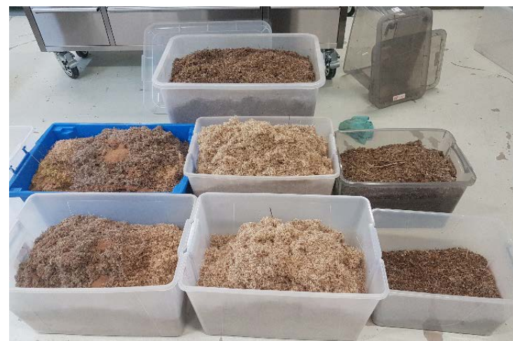
Above: Species rich seed mixes ready for seeding day.

Due to their size and proximity to urban infrastructure (i.e. water mains) we have been able to set up semi-permanent irrigation at two of these sites. This allows us to deliver moisture on a reliable basis for the establishment period. It has not been long since seeding, but our monitoring has already shown terrific emergence from the two earlier sown sites demonstrating quiet clearly just how important a factor water is. Having access to irrigation is a huge boon. It is seldom the case this can be done for large or remote sites. But where it is possible, and where seed quality and site preparation/seeding have been undertaken in the most appropriate fashion, access to a reliable irrigation can almost guarantee good restoration results. This is a critical outcome when working with clients who expect vegetation to appear promptly and reliably and where non-native landscaping is known to be effective and low cost.